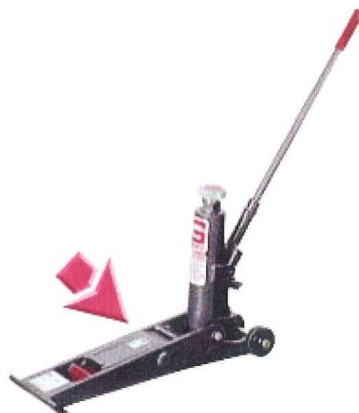
MODEL FLJ-400B / FLJ-400 / FLJ-400A Located on frame