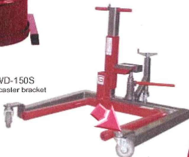
MODEL WD-150S Located on caster bracket