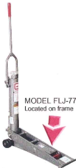
MODEL FLJ-770 Located on frame