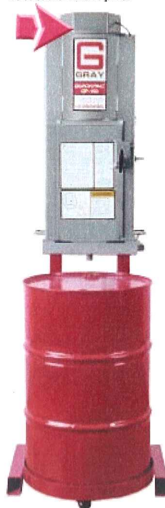
MODEL QP-100/QP-160 Located on front plate