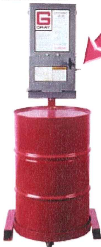
MODEL QP-50 Located inside door